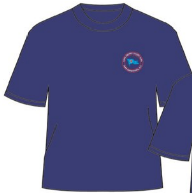
Red/ Lt Blue/ White ink on Navy T-Shirts Placement: Left Chest 3" W x 3" H