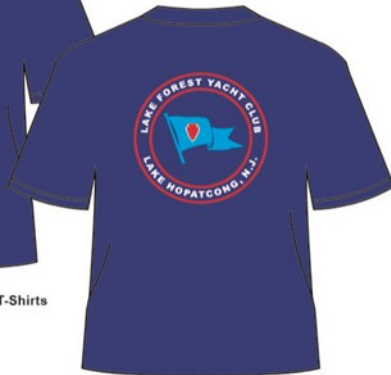
Red/ Lt Blue/ White ink on Navy T-Shirts Placement: Full Back 11" W x 11" H