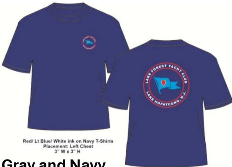
Red/ Lt Blue/ White ink on Navy T-Shirts Placement: Left Chest 3" W x 3" H